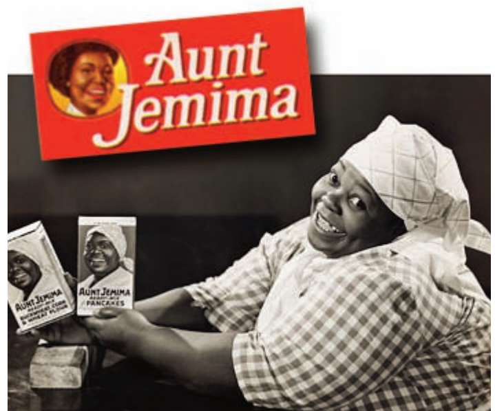
Aunt Jemima logo, Quaker division of PepsiCo; vintage Aunt Jemima actresses

The character is Uncle Ben, the symbol for more than 60 years of the Uncle Ben's line of rices and side dishes now sold by the food giant Mars. The challenges confronting Mars in reviving a character as racially fraught as Uncle Ben